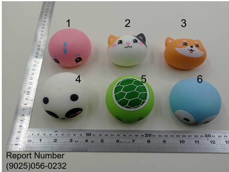
EXHIBIT # 2